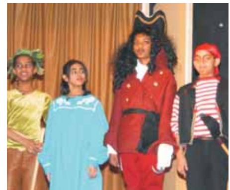
Peter Pan