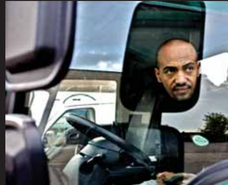
movin' on out...