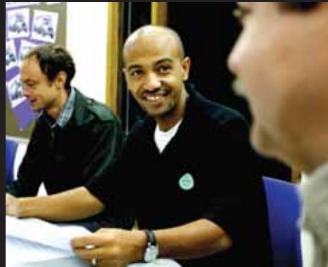
...the organization begins