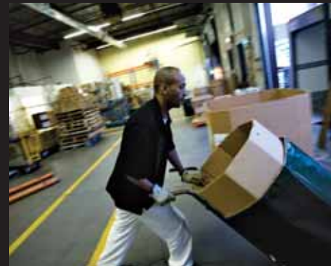
the day's work is underway...