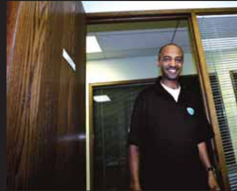
Greeting my coworkers