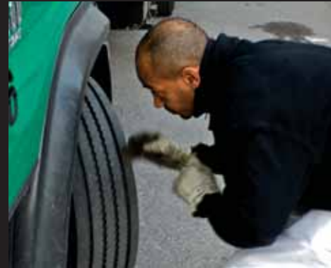
...nothing goes unchecked