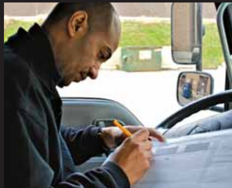
Planning the day's route...