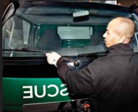
The morning mechanical check