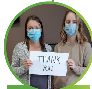
CareN'Share Inc Family Resource Center, NB