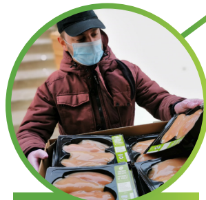
Horizons For Youth, ON