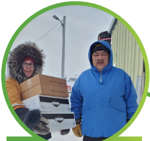
Hamlet of Whale Cove, NV

When COVID-19 hit, hunger increased - and generous supporters like you rose to meet the crisis head on, helping the Second Harvest team expand our services to rescue and redistribute surplus food nationwide. Although masks, social distancing, and talk of vaccines became our new normal, you made sure that hunger didn't by helping feed people in need from coast to coast to coast.