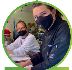
Kimberly Wellness Foundation, BC

Provide support to over 900 communities from coast to coast to coast!